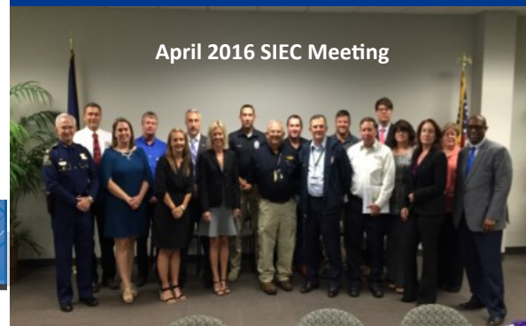
April 2016 SIEC Meeting

2016 Outreach and Consultation to obtain State inputs via a variety of opportunities: