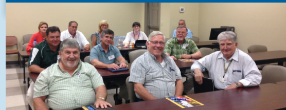
PARTICIPANTS AT A RECENT LOUISIANA FIRSTNET EVENT

With YOUR help, we are 20% of the way there! To ensure your voice is heard, complete the survey TODAY!